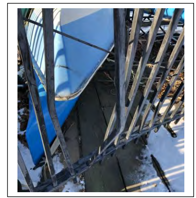
RYC "Gate": mystery solved and minimal damage to the club property.

Miracle #5: the driver turned around without hitting any J-22s out there.